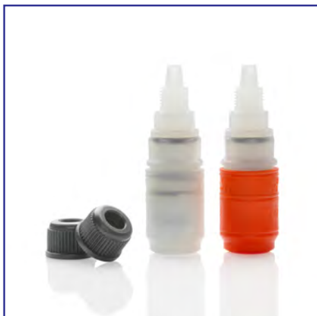
3/8" OD x 1/4" Tubing