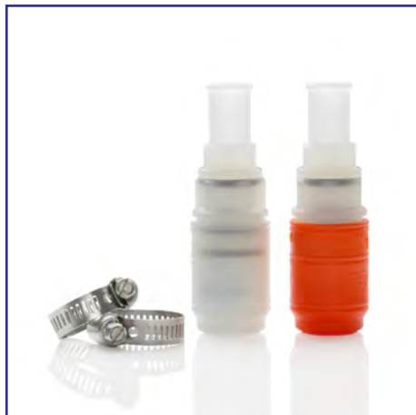
1/2" Hose Barb