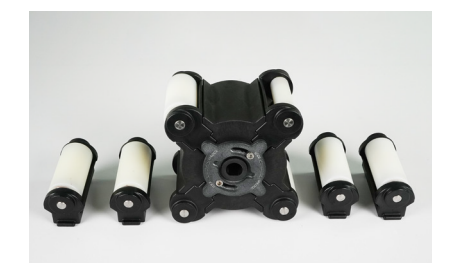
Switch to different tube models by changing the squeeze rollers, not the entire roller assembly.