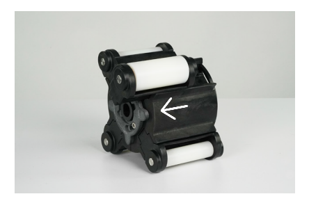
Rollers can be replaced individually, eliminating the need to purchase an entire roller assembly.