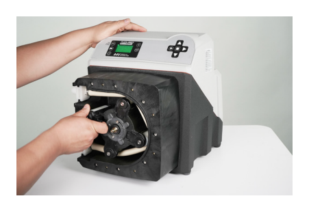
New roller assembly design allows for safer and easier tube replacement, without the need for a tube installation tool.